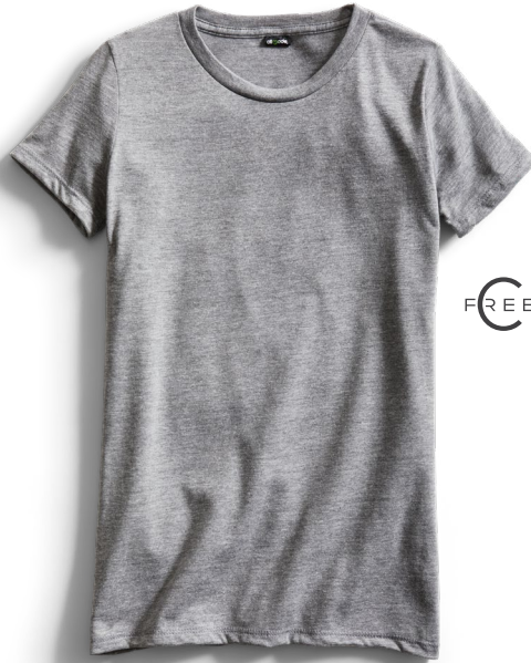
FREE Allmade® Women's Tri-Blend Tee AL2008 Women's Sizes: XS-2XL 12 colors