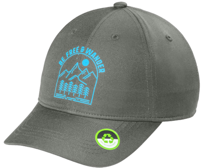
Port Authority® Eco Cap C954 | 4 colors