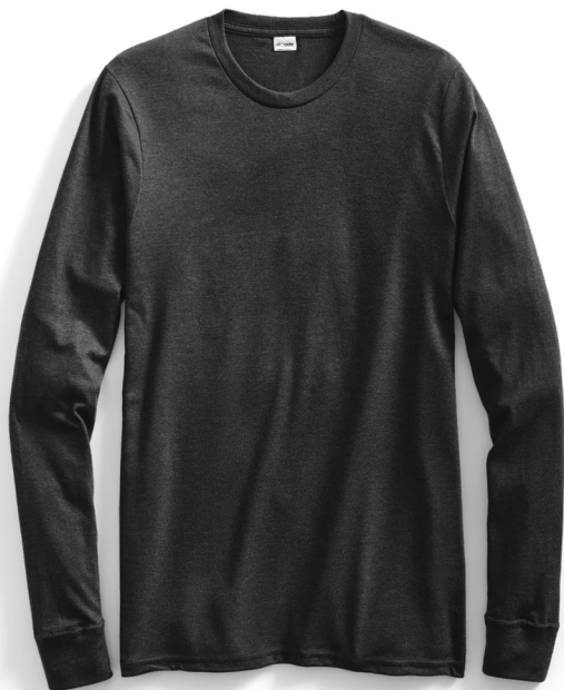
FREE Allmade® Unisex Tri-Blend Long Sleeve Tee AL6004 Unisex Sizes: XS-4XL 13 colors

Made with a sustainable blend of recycled polyester, organic cotton and modal.