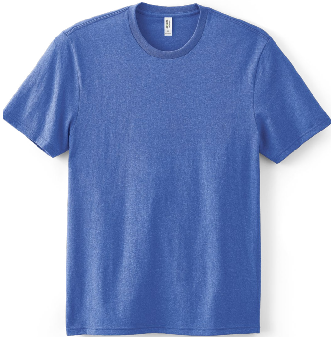
FREE Allmade® Unisex Recycled Blend Tee AL2300 | Unisex Sizes: XS-4XL | 5 Colors

Made with reclaimed cotton scraps and recycled polyester.