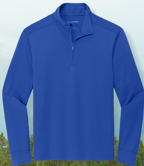
FREE Port Authority® C-FREE® Snag-Proof 1/4-Zip K865 | Adult Sizes: XS-4XL | 4 colors