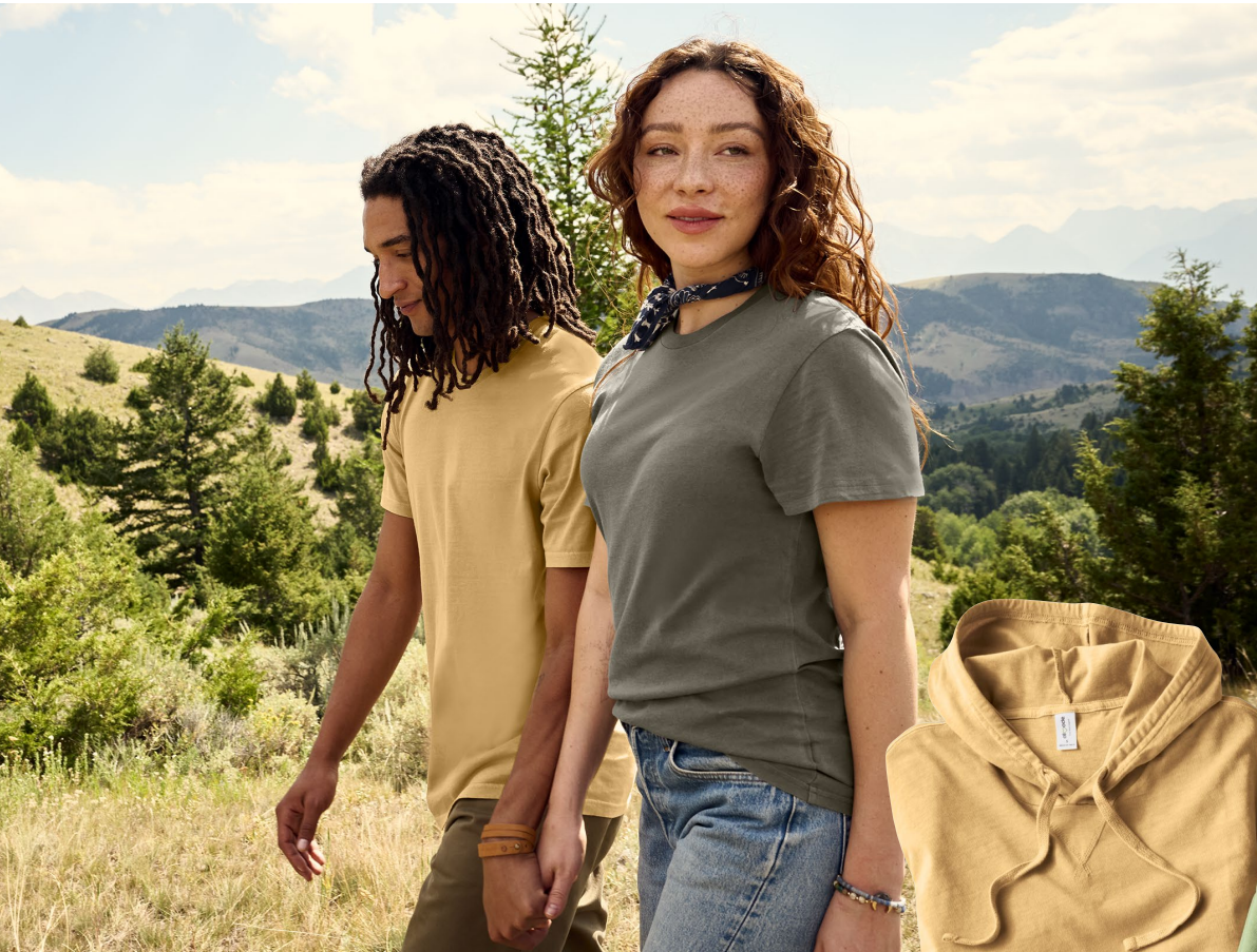
Allmade® Unisex Mineral Dye Organic Cotton Tee AL2400 | Unisex Sizes: XS-4XL | 4 colors