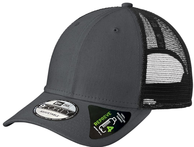
New Era® Recycled Snapback Cap NE208 | 5 colors