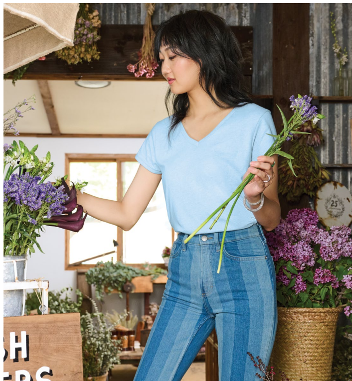
FREE District® Women's Re-Tee® V-Neck DT8001 | Women's Sizes: XS-4XL | 11 colors