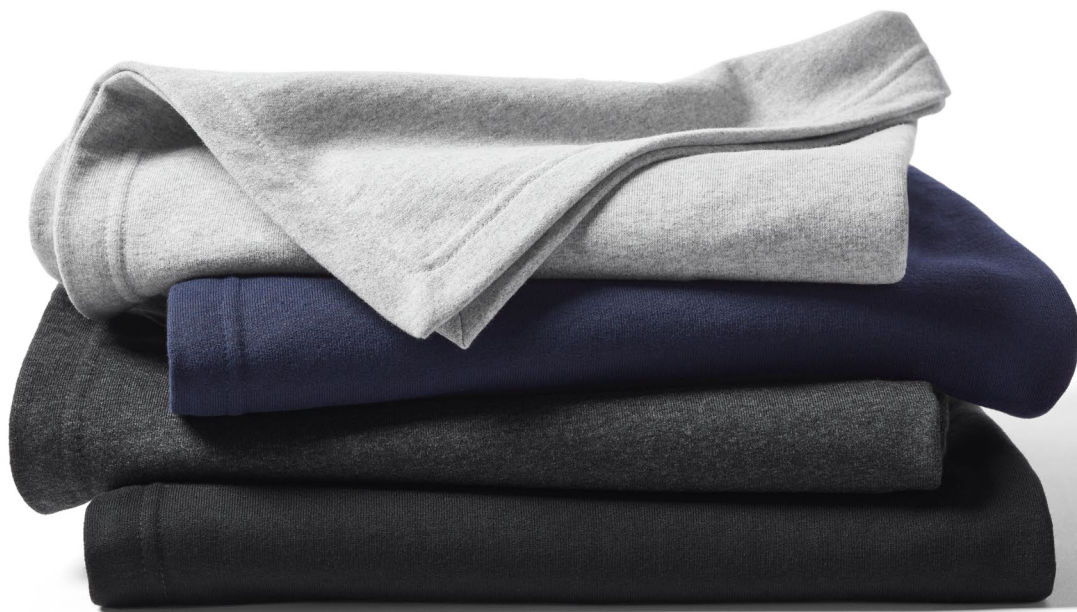
District® Re-Blanket™ DT81 | 4 colors