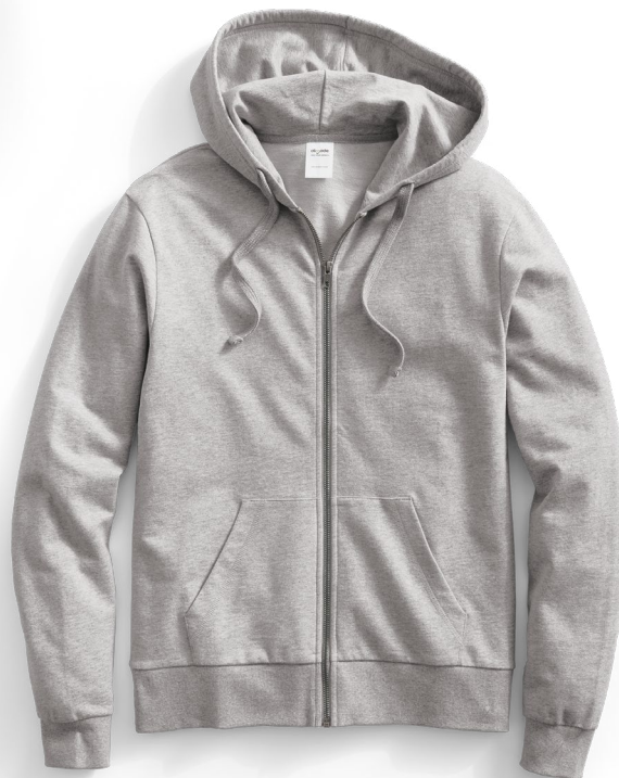
FREE Allmade® Unisex Organic French Terry Full-Zip Hoodie AL4002 | Unisex Sizes: XS-4XL | 4 colors