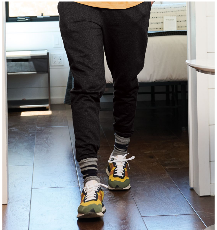
District® Re-Fleece™ Jogger DT8107 | Adult Sizes: XS-4XL | 2 colors