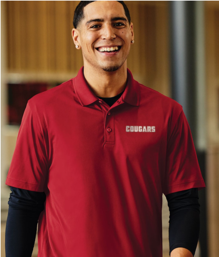
FREE Sport-Tek® PosiCharge® Re-Compete Polo ST725 | Adult Sizes: XS-4XL | 9 colors