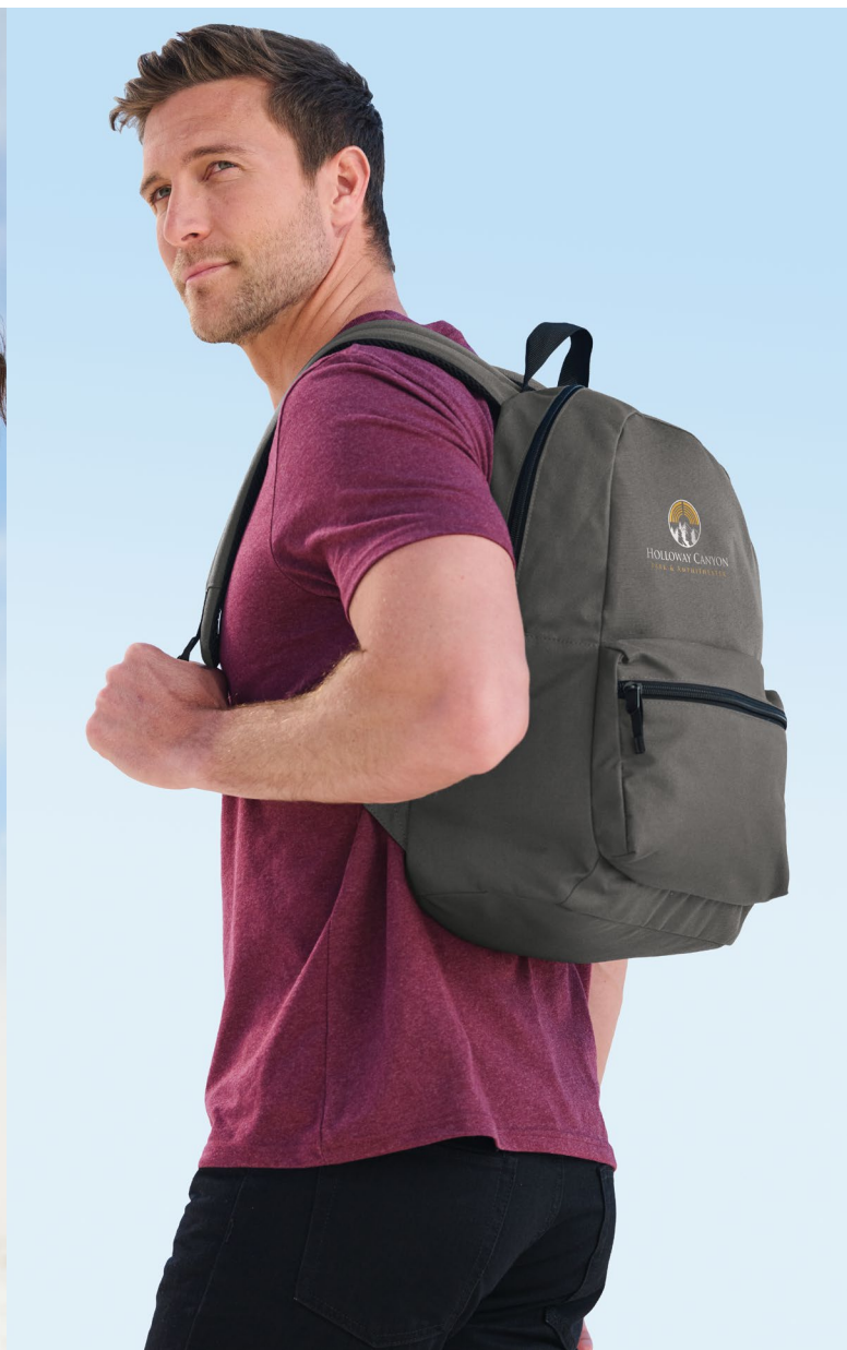
Port Authority® C-FREE® Recycled Backpack BG270 | 3 colors