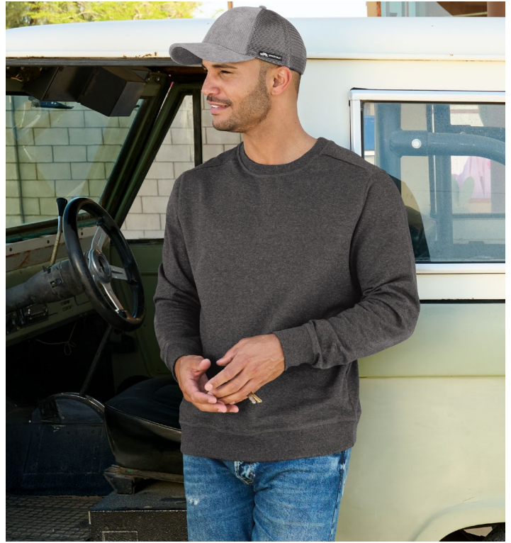
District® Re-Fleece™ Crew DT8104 | Adult Sizes: XS-4XL | 4 colors