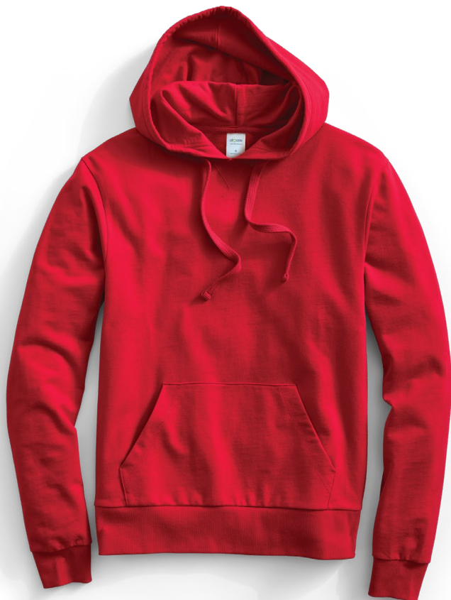
FREE Allmade® Unisex Organic French Terry Pullover Hoodie AL4000 Unisex Sizes: XS-4XL 6 colors

French terry styles and cotton tees are made from 100% organic cotton fabric.