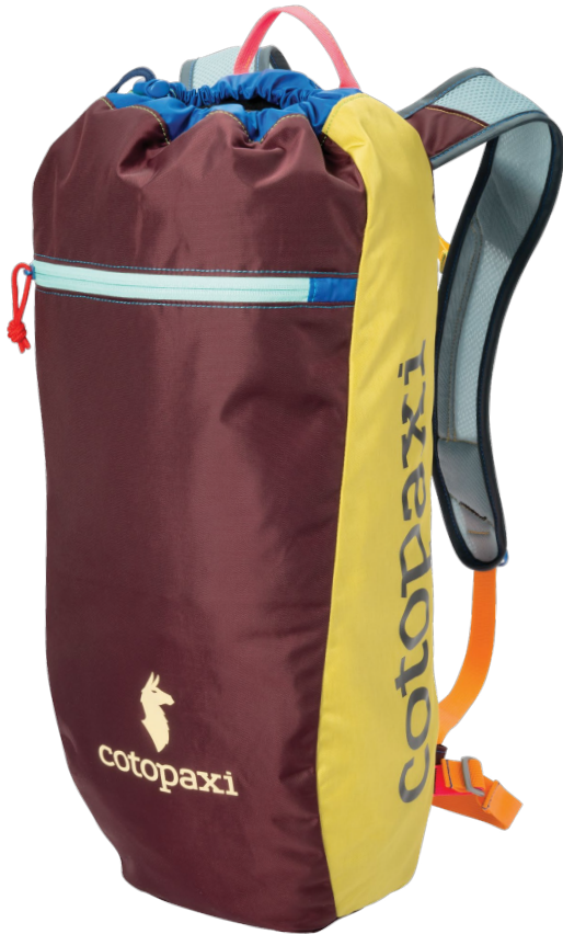
Cotopaxi Luzon 18L Backpack COTOL18L | color: Surprise

Made from a collection of fabric remnants in unique surprise color combinations.