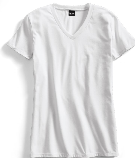
FREE Allmade® Women's Tri-Blend V-Neck Tee AL2018 Women's Sizes: XS-2XL 17 colors