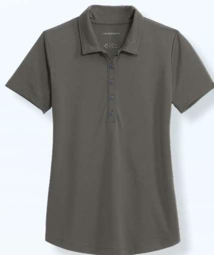
FREE Port Authority® Ladies C-FREE® Snag-Proof Polo LK864 | Ladies Sizes: XS-4XL | 6 colors