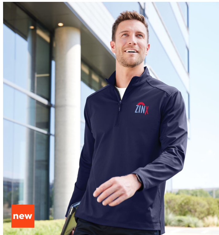
FREE Port Authority® C-FREE® Double Knit 1/4-Zip K880 | Adult Sizes: XS-4XL | 6 colors

Performance with an Earth-first attitude.