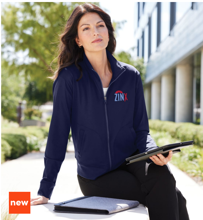
FREE Port Authority® Ladies C-FREE® Double Knit Full-Zip LK881 | Ladies Sizes: XS-4XL | 4 colors