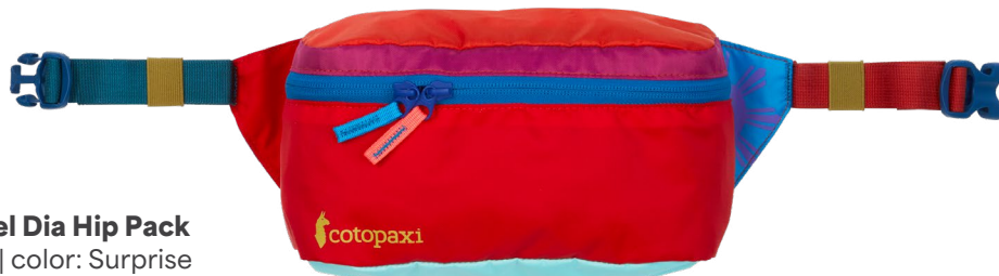
Cotopaxi Del Dia Hip Pack COTODDFP | color: Surprise