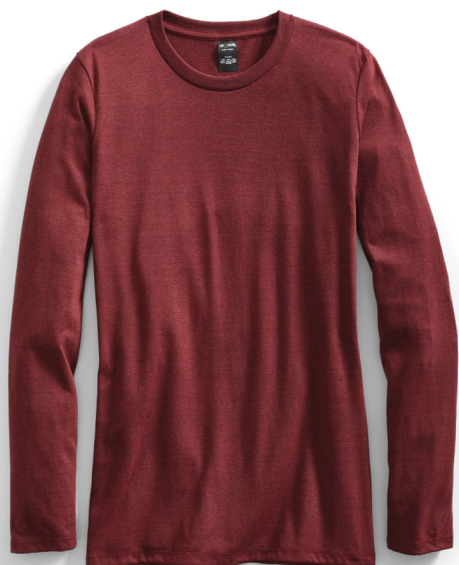
FREE Allmade® Women's Tri-Blend Long Sleeve Tee AL6008 | Women's Sizes: XS-2XL | 9 colors