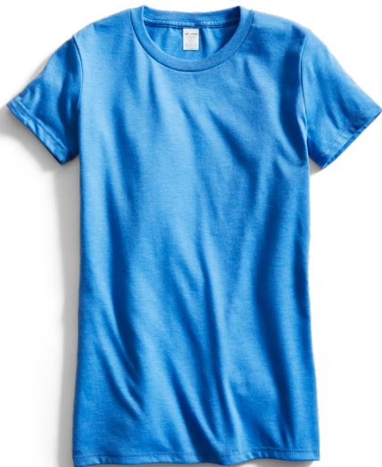
FREE Allmade® Youth Tri-Blend Tee AL207 | Youth Sizes: XS-XL | 10 colors