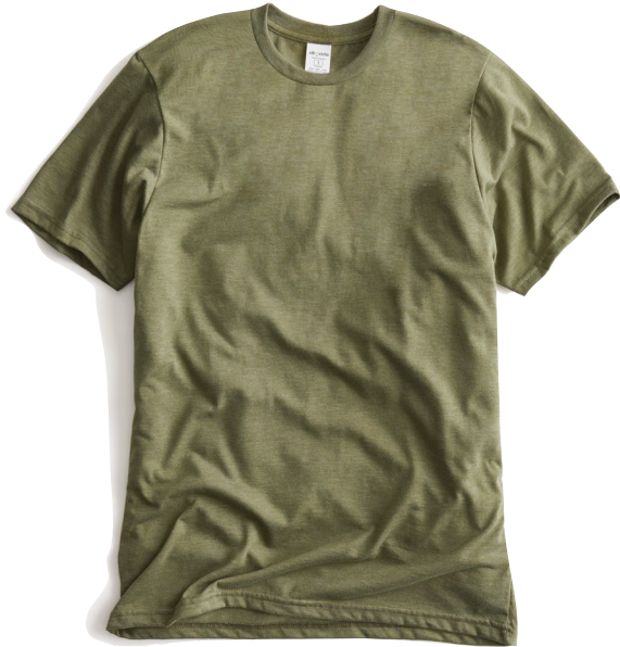
FREE Allmade® Unisex Tri-Blend Tee AL2004 Unisex Sizes: XS-4XL 22 colors

Feel your impact in these crazy-soft sustainable tees.