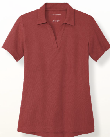
FREE Port Authority® Ladies C-FREE® Cotton Blend Pique Polo LK867 | Ladies Sizes: XS-4XL 7 colors