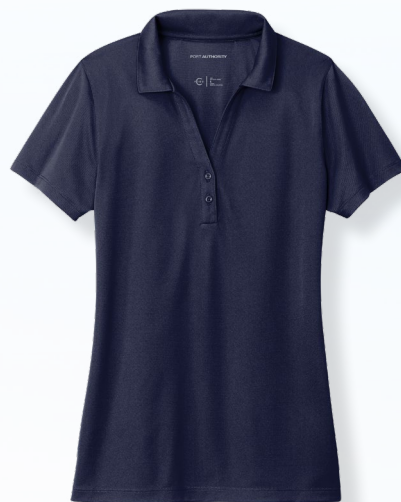
FREE Port Authority® Ladies C-FREE® Performance Polo LK863 | Ladies Sizes: XS-4XL | 6 colors