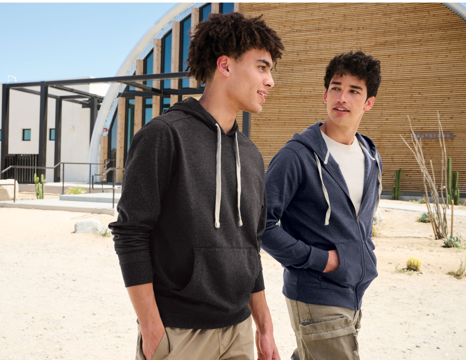
District ® Re-Fleece ™ Hoodie DT8100 | Adult Sizes: XS-4XL | 7 colors