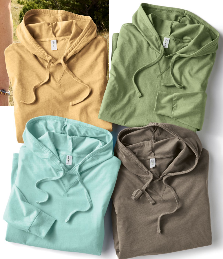
Allmade® Unisex Mineral Dye Organic Cotton Hoodie Tee AL6305 | Unisex Sizes: XS-4XL | 4 colors