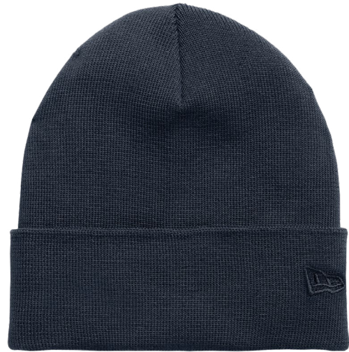
New Era® Recycled Cuff Beanie NE907 | One Size Fits Most | 3 colors