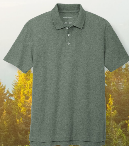
FREE Port Authority® C-FREE® Cotton Blend Pique Polo K867 | Adult Sizes: XS-4XL | 7 colors