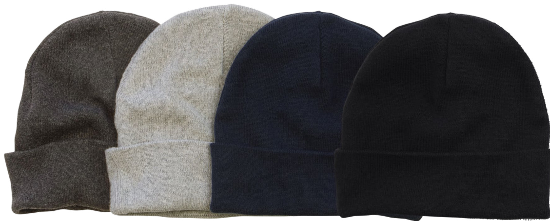
District® Re-Beanie™ DT815 | One Size Fits Most | 4 colors

Made from the Re-Fleece™ recycled materials you know and love.