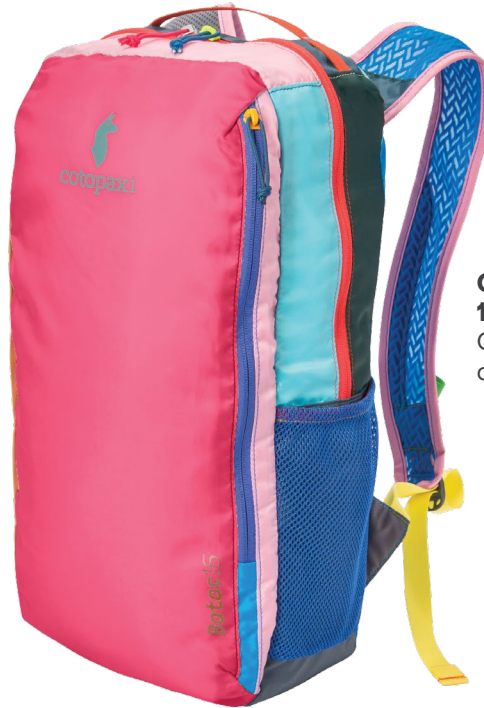
Cotopaxi Batac 16L Backpack COTOBTP | color: Surprise