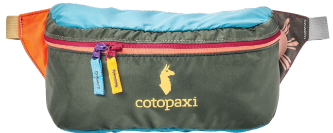
Cotopaxi Bataan Hip Pack COTOBFP | color: Surprise