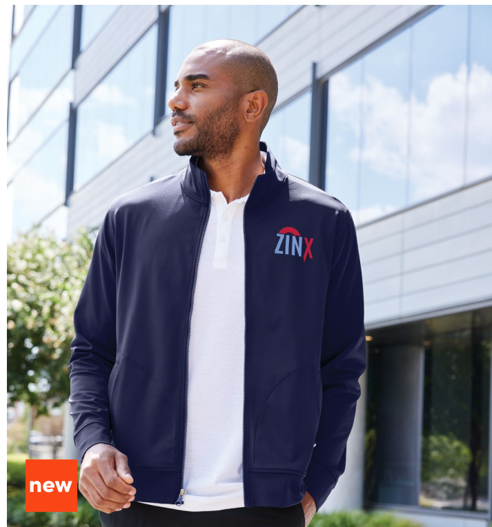
FREE Port Authority® C-FREE® Double Knit Full-Zip K881 | Adult Sizes: XS-4XL | 5 colors