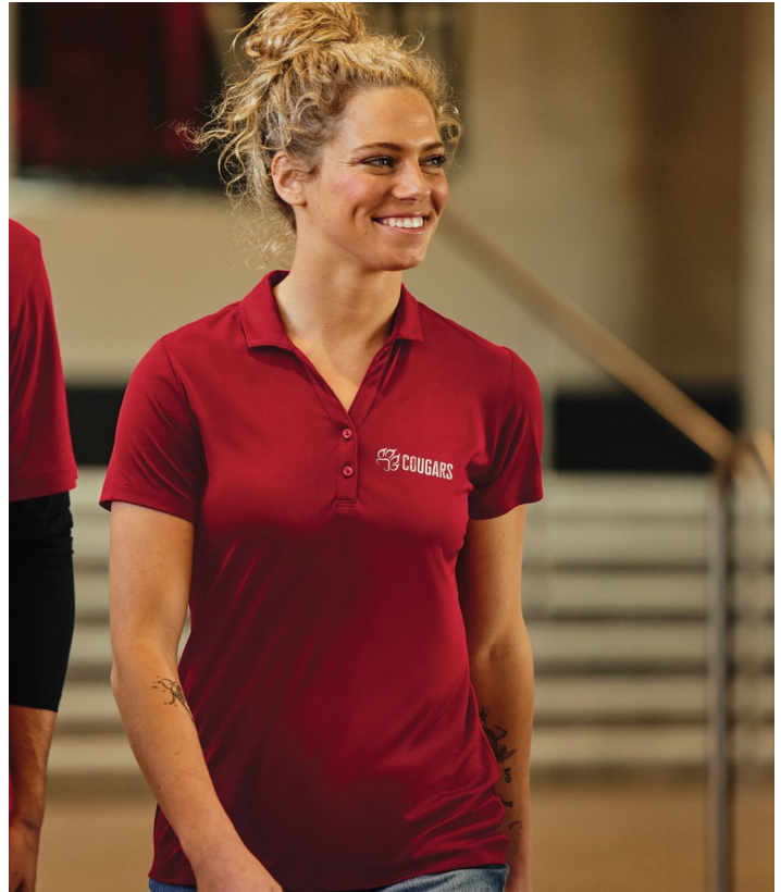
FREE Sport-Tek® Ladies PosiCharge® Re-Compete Polo LST725 | Ladies Sizes: XS-4XL | 9 colors