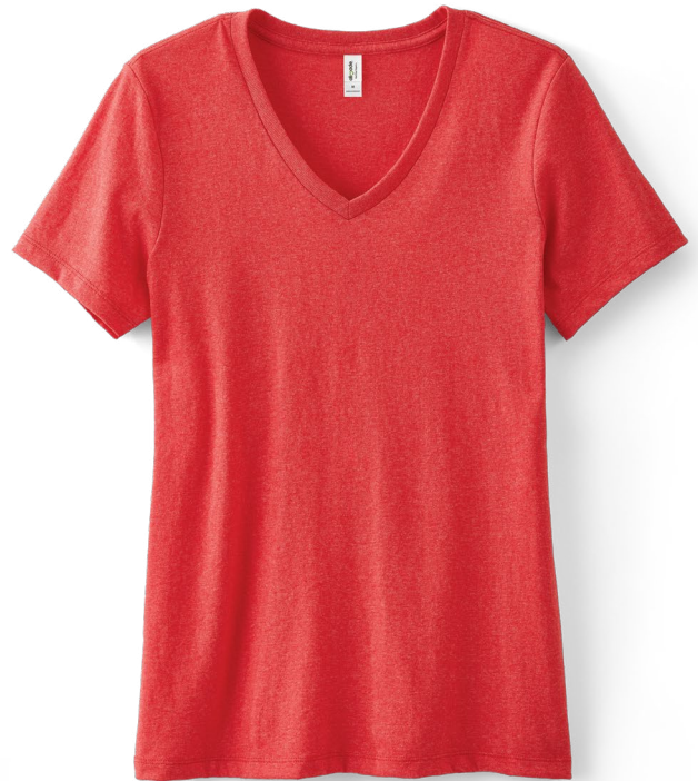
FREE Allmade® Women's Recycled Blend V-Neck Tee AL2303 | Women's Sizes: XS-2XL | 5 Colors