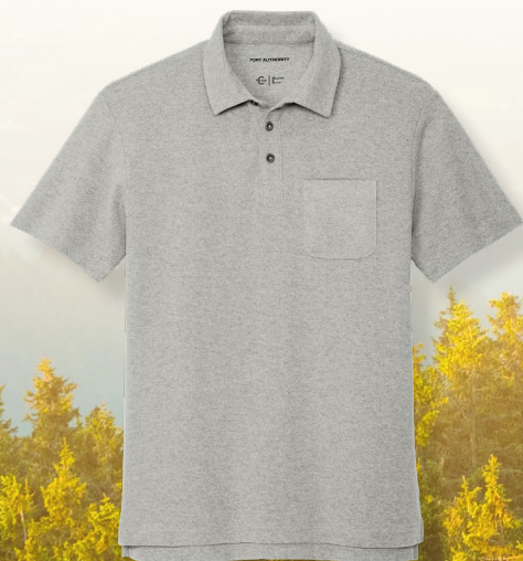
FREE Port Authority® C-FREE® Cotton Blend Pique Pocket Polo K868 | Adult Sizes: XS-4XL | 7 colors