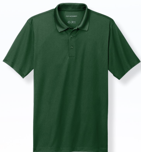
FREE Port Authority® C-FREE® Performance Polo K863 | Adult Sizes: XS-4XL | 7 colors