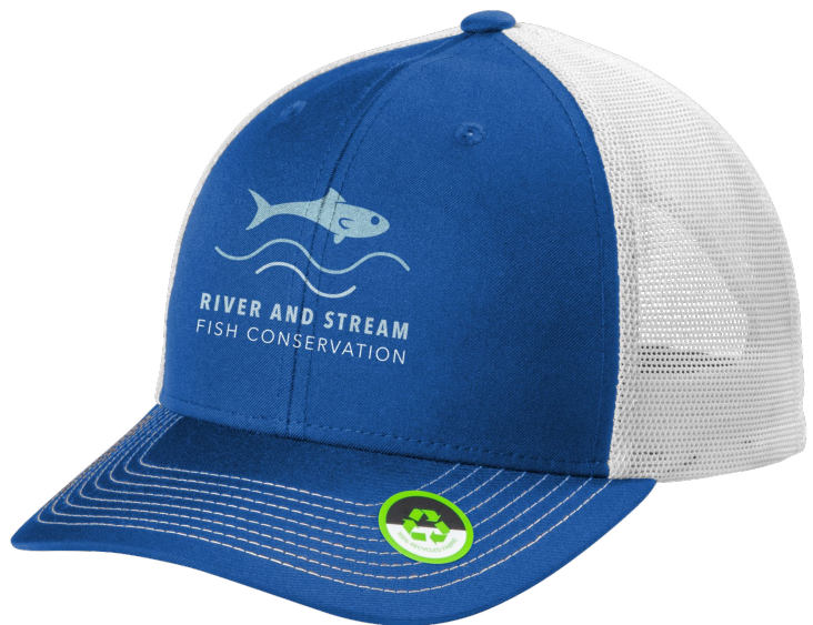
Port Authority® Eco Snapback Trucker Cap C112ECO | 5 colors