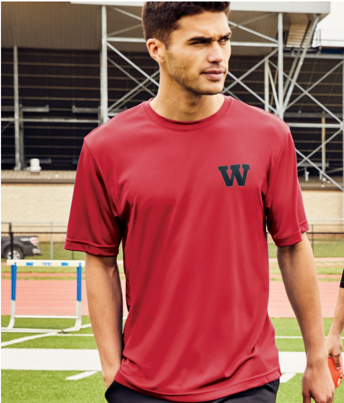
FREE Sport-Tek® PosiCharge® Re-Compete Tee ST720 | Adult Sizes: XS-4XL | 9 colors