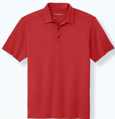
FREE Port Authority® C-FREE® Snag-Proof Polo K864 | Adult Sizes: XS-4XL | 6 colors