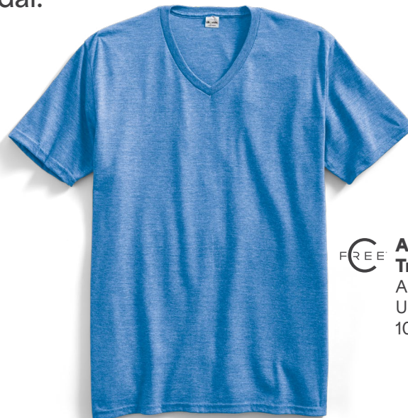
FREE Allmade® Unisex Tri-Blend V-Neck Tee AL2014 Unisex Sizes: XS-4XL 10 colors