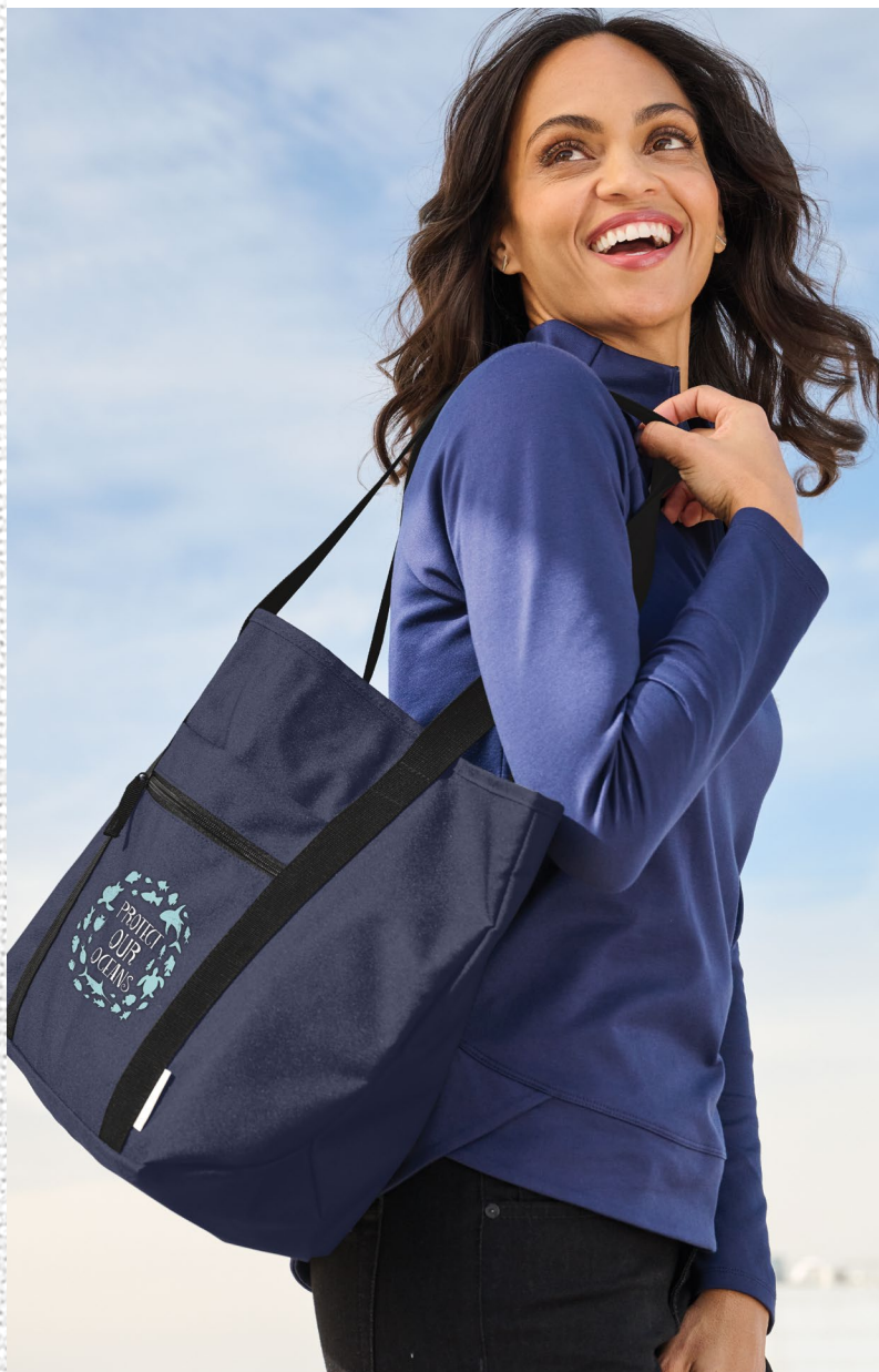
Port Authority® C-FREE® Recycled Tote BG470 | 3 colors

Lighten your load and lower your footprint.