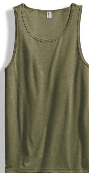
FREE Allmade® Unisex Tri-Blend Tank AL2019 Unisex Sizes: XS-4XL 6 colors