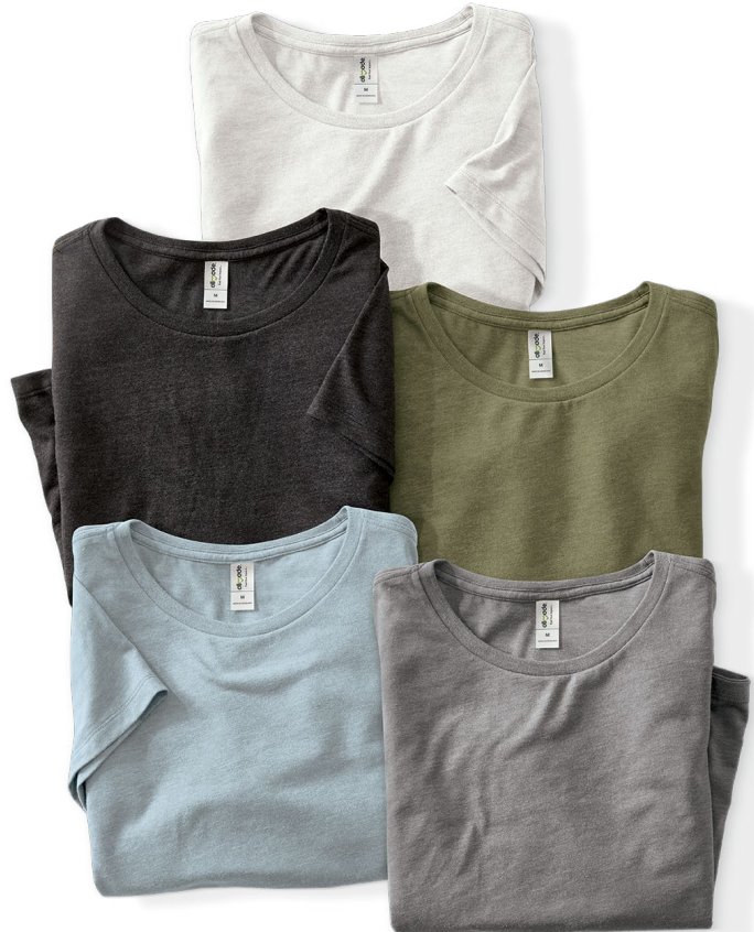
FREE Allmade® Women's Relaxed Tri-Blend Scoop Neck Tee AL2015 | Women's Sizes: XS-2XL | 5 colors