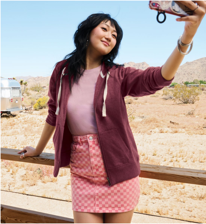
District® Women's Re-Fleece™ Full-Zip Hoodie DT8103 | Women's Sizes: XS-4XL | 5 colors