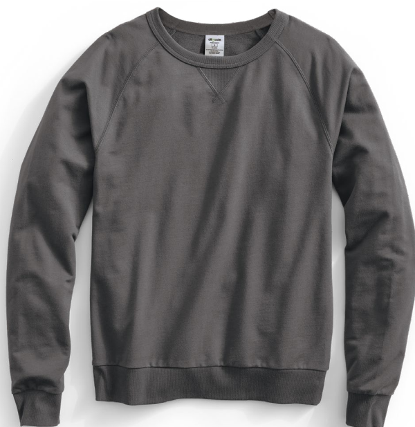
FREE Allmade® Unisex Organic French Terry Crewneck Sweatshirt AL4004 | Unisex Sizes: XS-4XL | 4 colors