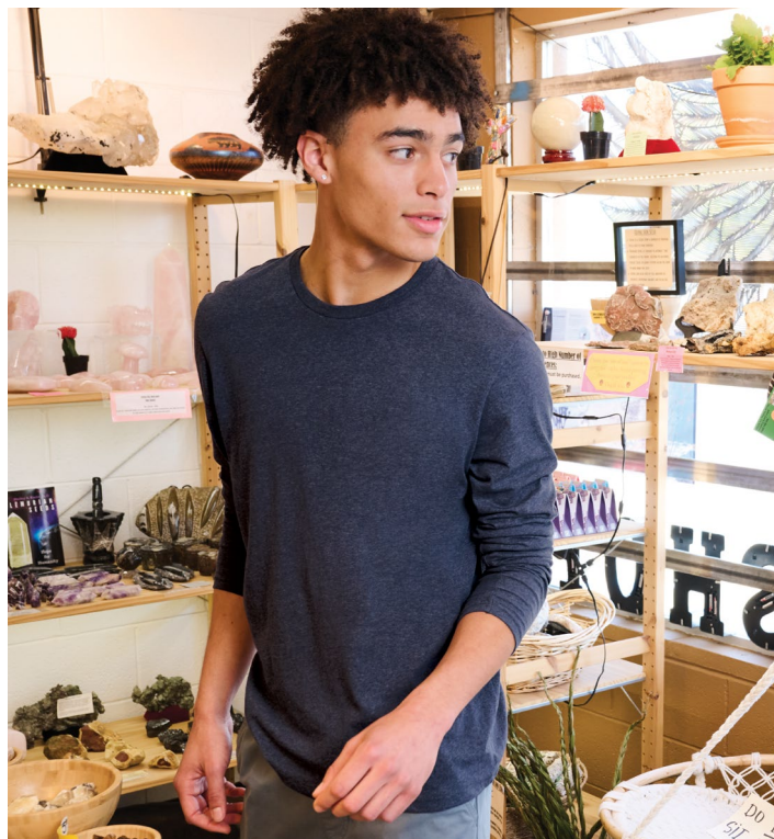
FREE District® Re-Tee® Long Sleeve DT8003 | Adult Sizes: XS-4XL | 5 colors