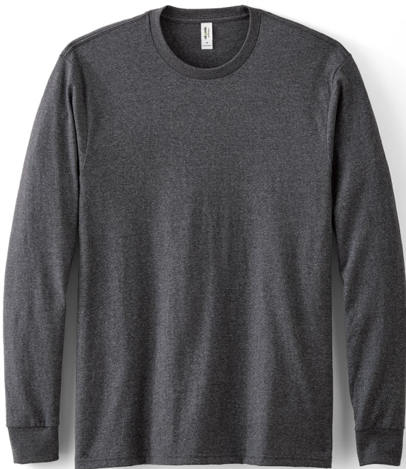
FREE Allmade® Unisex Long Sleeve Recycled Blend Tee AL6204 | Unisex Sizes: XS-4XL | 4 colors